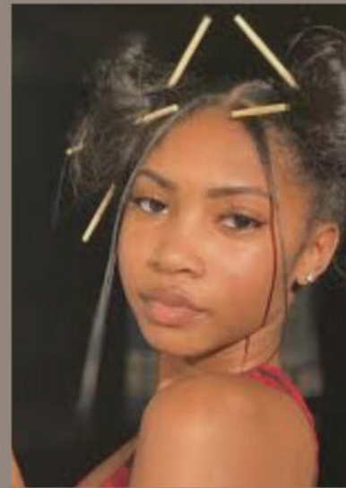
Ponytails w/ chopsticks

90'S HAIR SHOWED THE REAL FROM THE FAKE, AND WHAT I MEAN IS ARTISTRY! THE STYLIST IN THAT PARTICULAR DECADE TO MUCH PRIDE IN THEIR CRAFT, AS WELL AS THEIR PRESENTATION. I CAN REMEMBER AS A GIRL GROWING UP, I WOULD SIT AND LOOK AT MY HAIRSTYLIST MOLD, SHAPE, AND CREATE A MASTERPIECE WITH IRONS, HAIR/BOBBY PINS, HAIRSPRAY/SPRITZ, GEL, AND A DIFFUSER(BLOW DRYER). THE AMOUNT OF TALENT AND SKILL WAS DISPLAYED ON SOMEONE'S HEAD WAS IMPRESSIVE.